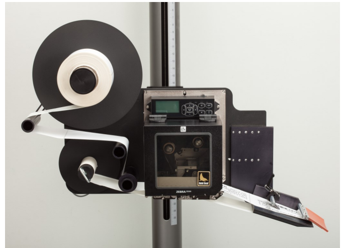
Available in right (above) or left (below) configurations.